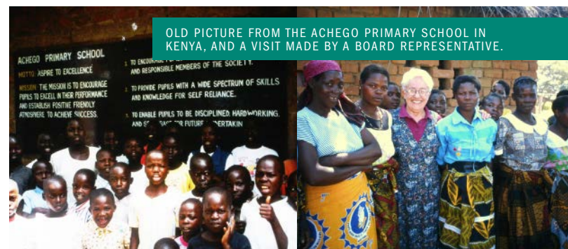
OLD PICTURE FROM THE ACHEGO PRIMARY SCHOOL IN KENYA, AND A VISIT MADE BY A BOARD REPRESENTATIVE.

humbly say that the Lord has given various gifts to the many committed Board members and members of subcommittees who have served over the last sixty years. The Lord has also given gifts to our partners and their communities, who bless us in sometimes unexpected ways. This is evident in the updates from the various projects that you can read about in this newsletter. We will expand on this more in the Spring 2025 newsletter as well. May the Lord continue to receive honour and glory through our work!