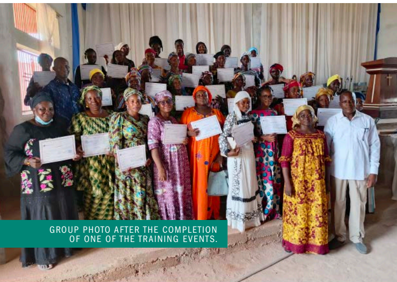
GROUP PHOTO AFTER THE COMPLETION OF ONE OF THE TRAINING EVENTS.