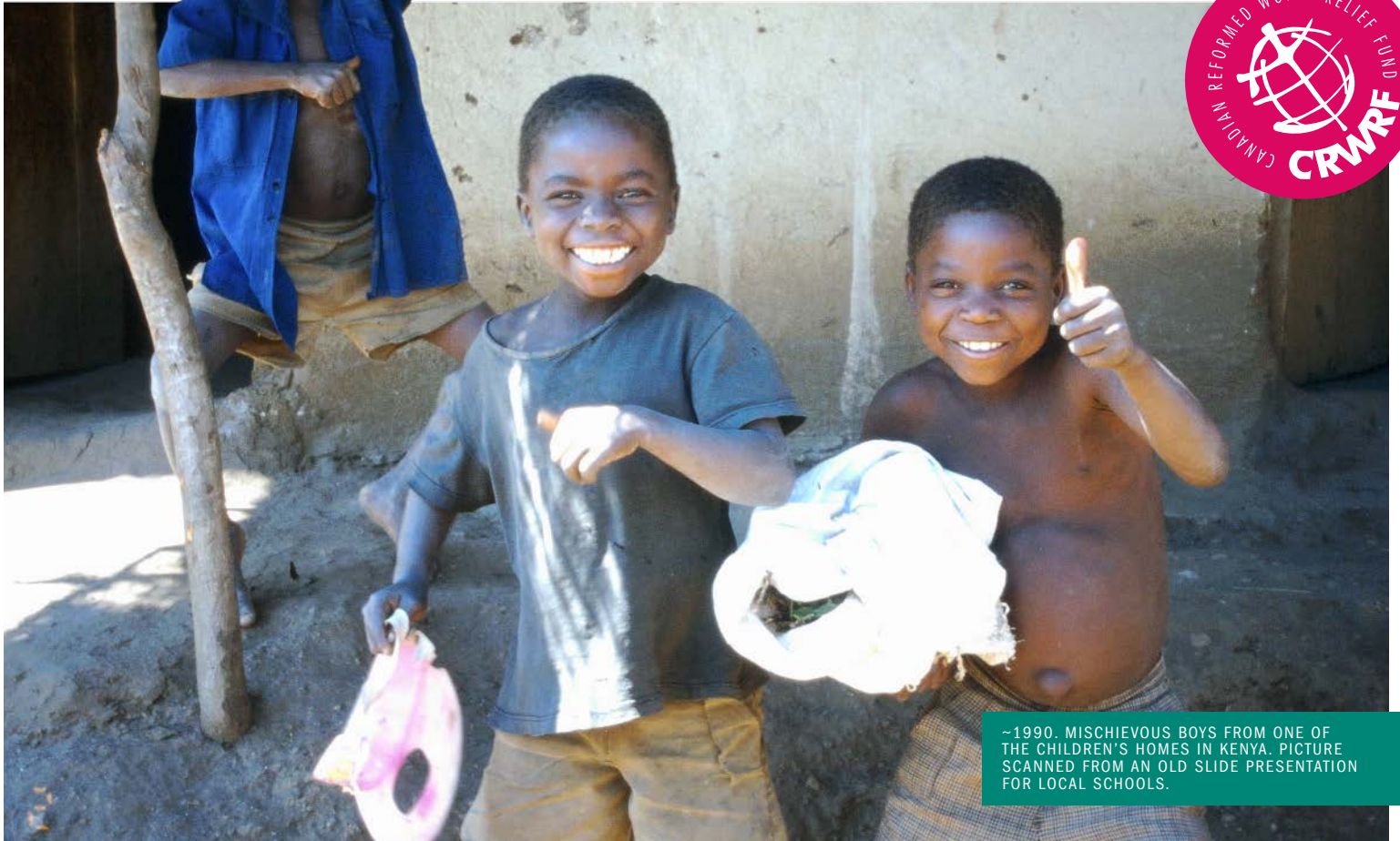
~1990. MISCHIEVOUS BOYS FROM ONE OF THE CHILDREN'S HOMES IN KENYA. PICTURE SCANNED FROM AN OLD SLIDE PRESENTATION FOR LOCAL SCHOOLS.

The Lord willing, and with great thankfulness, we look forward to celebrating 60 years of CRWRF in 2025. We hope to take this special anniversary as an opportunity to reflect on God's goodness and faithfulness over the past six decades. The theme that we've chosen for the year is God's Good Gifts . We hope to celebrate these gifts in various ways, including conferences in a few provinces and a special publication. In 1965, our church community's thankfulness for the free gift of salvation in Christ Jesus our Lord served as a foundational principle for establishing CRWRF. It continues to be a main motivator for our work today. Indeed, the Lord has given so many gifts! In addition to the amazing gift of salvation, God gifts his people in many other ways, e.g., good health, wisdom, knowledge, family, friendships, community, work, and the ability to teach, preach, and serve. The Lord has given gifts to you, our supporting community, resulting in many opportunities for you to be generous towards the work of CRWRF. We praise and thank the Lord for that! We can also