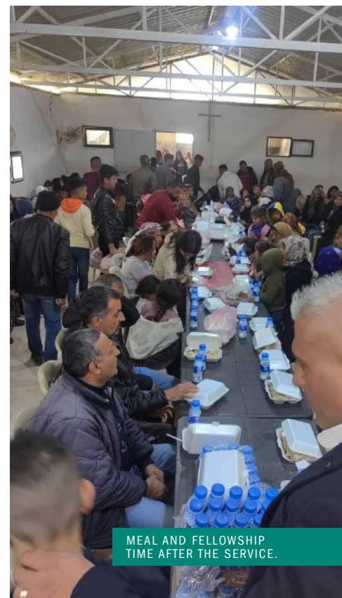
MEAL AND FELLOWSHIP TIME AFTER THE SERVICE.

Thanks to the perseverance of pastors and believers in these difficult circumstances, the gift of the gospel continues to encourage and spread.