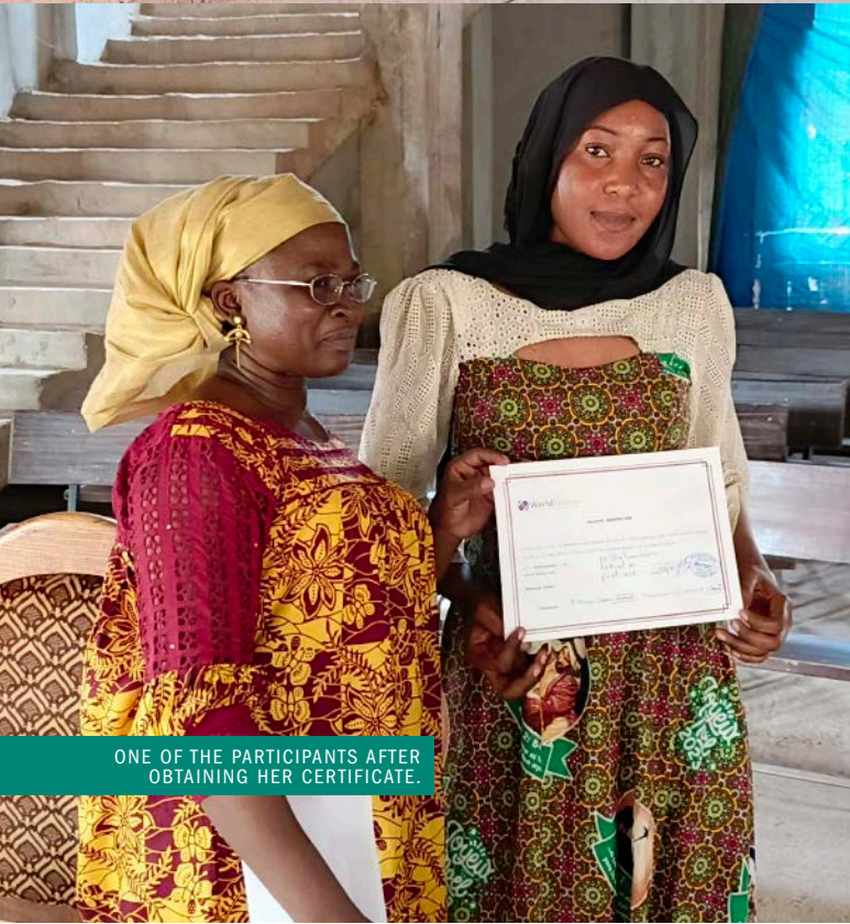
ONE OF THE PARTICIPANTS AFTER OBTAINING HER CERTIFICATE.