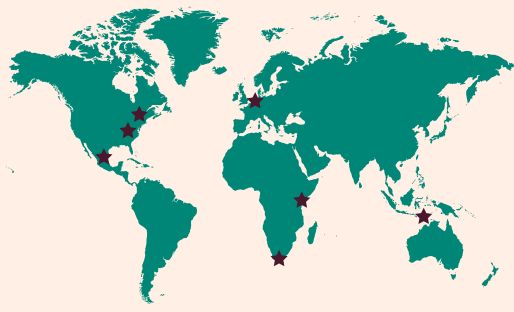
Partner organizations are located in Burlington, Kentucky, Mexico, Netherlands, Kenya, South Africa, Timor.