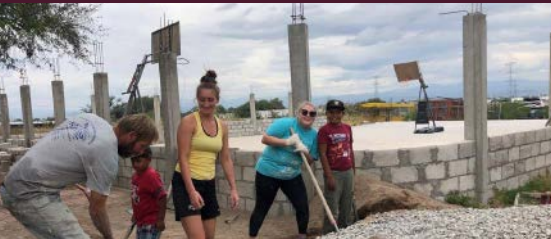
FAITHWORKS TRIP TO PAN DE VIDA