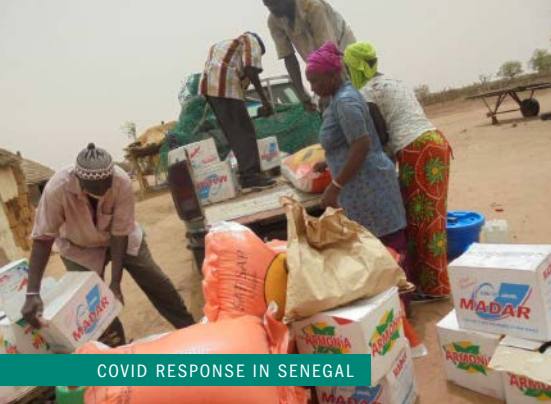
COVID RESPONSE IN SENEGAL

accountable to the board to ensure that funds received are used appropriately. The board sets out several requirements that each partner must satisfy before we start working together with them. These are outlined in our guiding principles and include such qualifications as: they must address needs which result from the temporal circumstances of the recipients; they must operate consistently with biblical principles; they use work opportunities to build capacity of recipients, so as to reduce dependency; and they must engage and work alongside the local church and its members whenever possible.