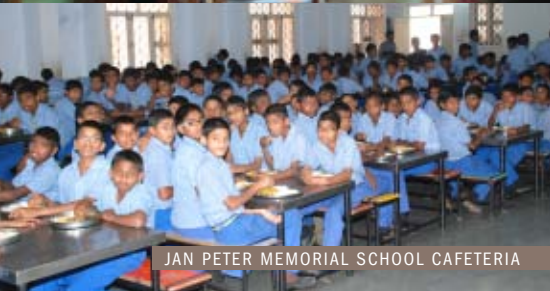
JAN PETER MEMORIAL SCHOOL CAFETERIA