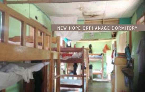
NEW HOPE ORPHANAGE DORMITORY