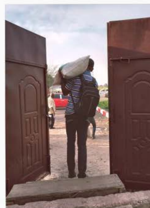
central africa Food relief following flooding