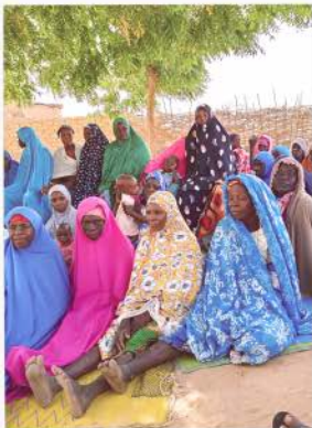
niger Resilient Communities participants