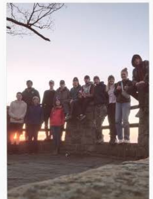
kentucky March 2023