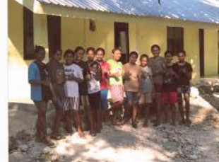
west timor Reconstructed girls' dormitory after cyclone

notes: Following severe flooding in 2022, CRWRF supported several rounds of food packages