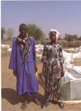
senegal Healthy Families and Communities participants