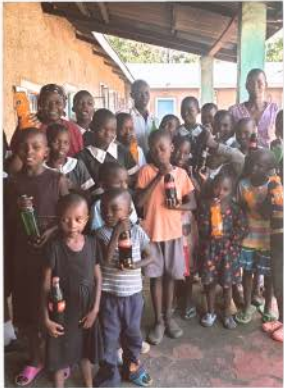
kenya Children at Achego enjoying soda from the church