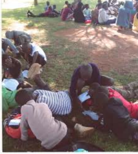
kenya Children at Tumaini participating in group activities during Sunday school camp