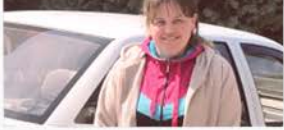
ukraine Food relief recipient