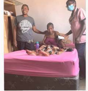
south africa Khothatsong Patient & Home-based care worker

Aiding people living with HIV/AIDS, as well as others affected by the disease, including caretakers or orphaned children