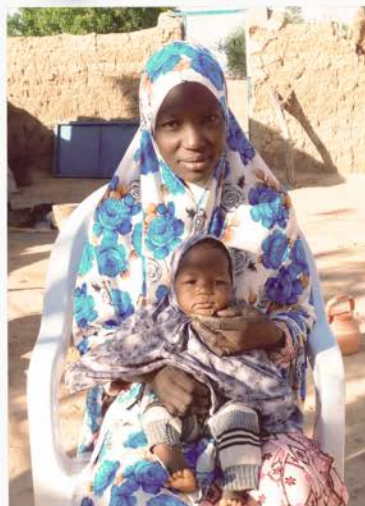
niger Resilient Communities Program participant