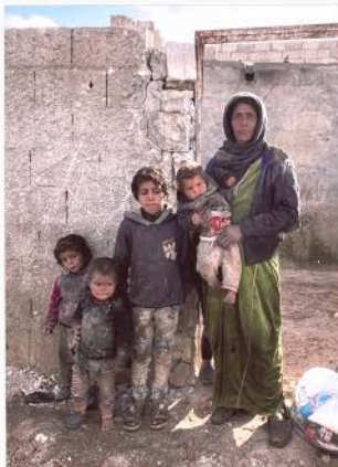
middle east Earthquake Relief for a mother and her children

Through the local Evangelical Covenant Church in Thailand,