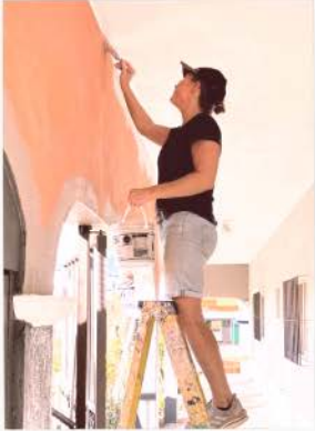
mexico January 2023