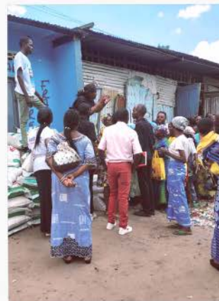
central africa Food relief following flooding