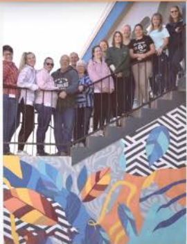
mexico January 2023

The committee also held a fundraiser dinner in the Niagara area for Children of Hope, which included presentations by three individuals involved with running the orphanages. They have also been investigating other service and learning trip opportunities.