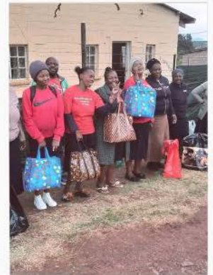
south africa Zisize Home-based care workers

The nursing team completes between 350 and 540 monthly visits